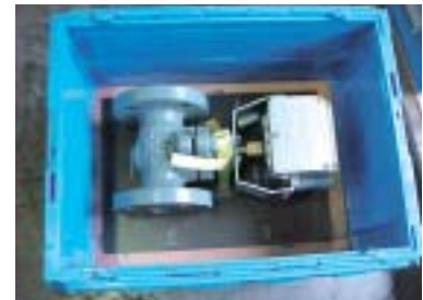
A rubber sheet is placed under heavy objects to prevent damage during transportation