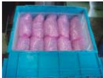
Transportation boxes reduce space by allowing compact and lightweight devices to be packed in layers and shipped together